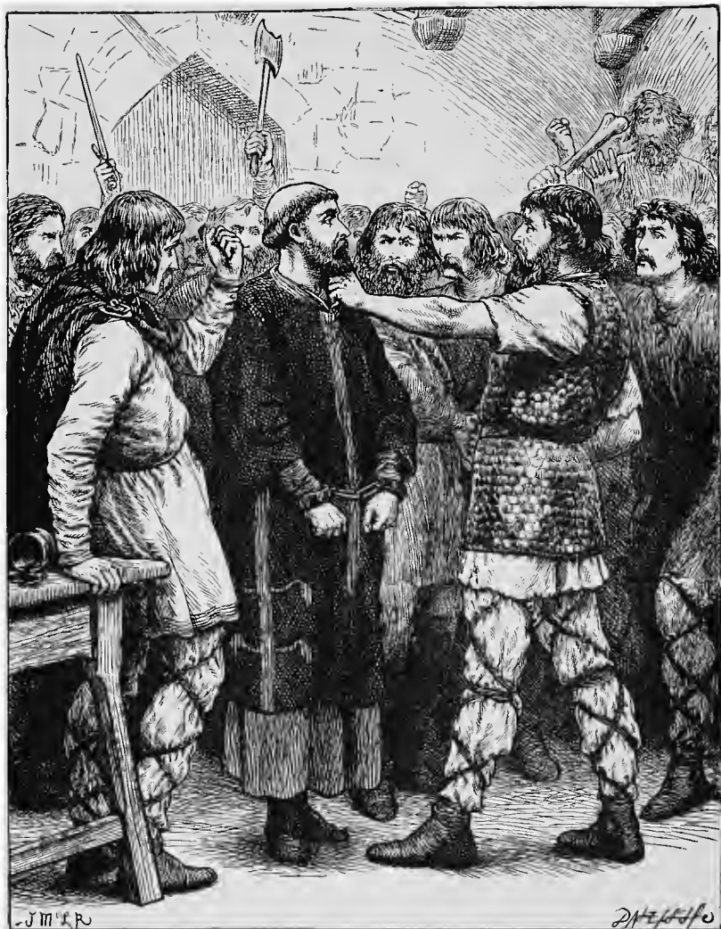
THE ARCHBISHOP OF CANTERBURY AND THE DANES.

[ Child's History of England, Frontispiece.